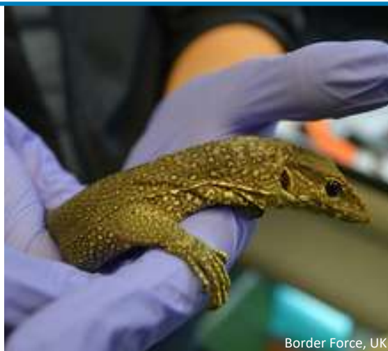
Border Force, UK

(Monitor lizard found in the baggage sorting area at Heathrow)