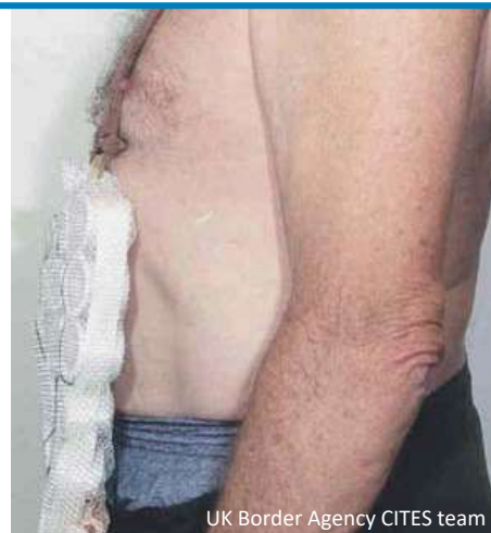
UK Border Agency CITES team