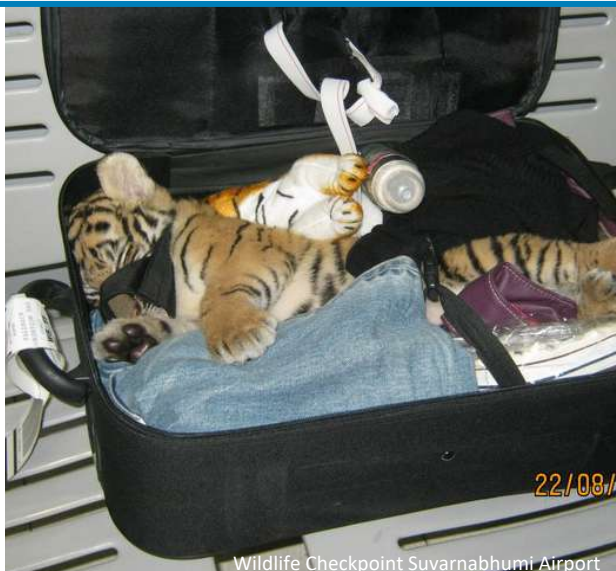
Wildlife Checkpoint Suvarnabhumi Airport

(Smuggled tiger cub discovered in carry-on baggage)